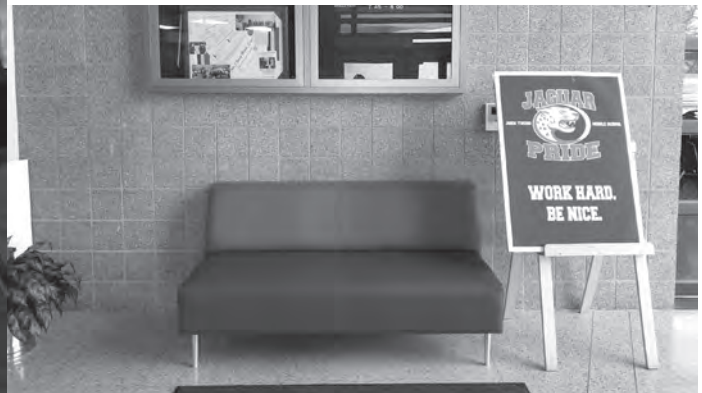
Area for parents to wait for their child to exit the building.

JYMS is excited our vestibule, office and foyer is almost complete! Door "A" is now operational and should be used by all visitors at JYMS. Our new vestibule allows us to provide a more secure environment for our students and staff. Remember ID is required by all visitors who enter JYMS. We are still waiting on our new security camera monitors for the