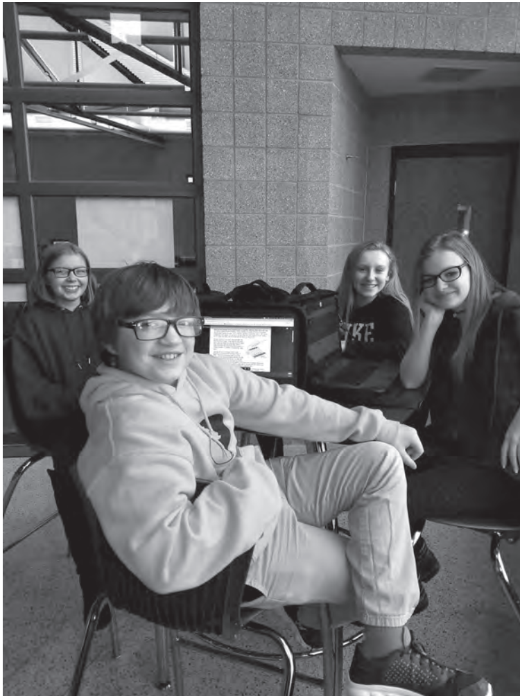
JYMS students enjoy our new cafe style table and chairs in updated lobby.