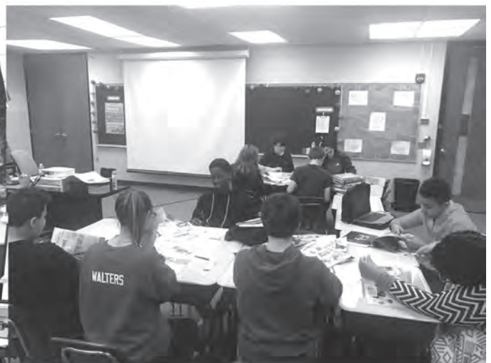
Pictured above: Students in Miss. LaForest's English class identify different types of print ads