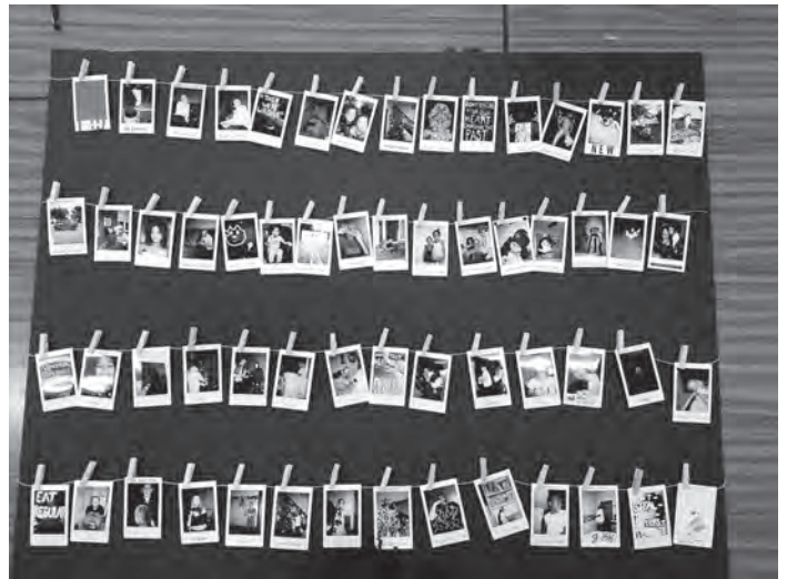
Dev Freet, 1973 Don't Forget Me , Photography