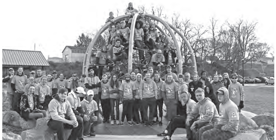
MHS and John Young students volunteer for Comcast Cares Day

Saturday, April 22, Mishawaka High School students took part in the Comcast Cares Day of Caring. Many groups from School City of Mishawaka were present, but one of the largest was our Early College students! It was an exhausting 4 ½ hours of picking up trash, mulching and raking, but well worth it to help spread the spirit of volunteerism and service with our students!